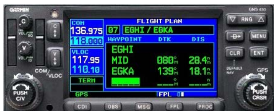
compare tracks and distances