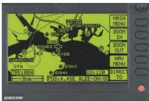
cross-check your position

g. If flying visually, it is easiest (but not usually particularly accurate) to cross-check your GPS position with a recognisable feature on the ground. You could also compare indications from a radio aid station with the GPS range and bearing to that station. Any difference greater than the normal error associated with the radio aid indicates a problem with one or other aid. If you cannot cross-check with a third system, especially if short of fuel or near controlled airspace, consider asking an ATS radar unit or Distress and Diversion Cell for a position fix.