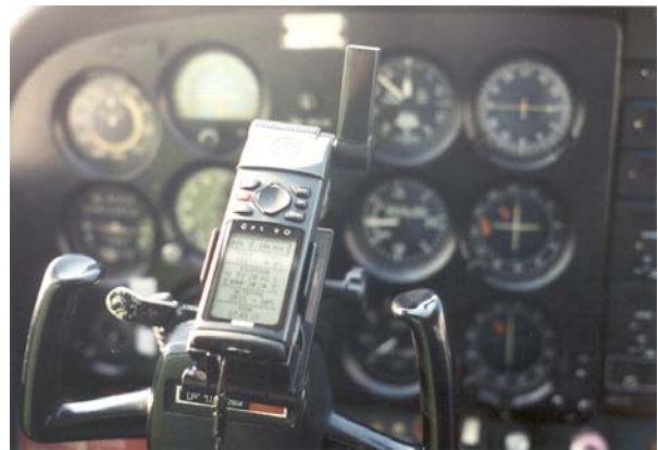
Equipment permanently installed...

When operating under Visual Flight Rules (VFR) outside controlled airspace, there is no requirement to carry any radio navigation equipment and there is no installation standard for GPS used only as an aid to visual navigation. However, equipment permanently installed (in any way) in an aircraft must be fitted in a manner approved by the CAA. If a hand held unit is carried, care should be taken to ensure that it, the antenna and any leads and fittings for them are secured in such a way that they cannot interfere with the normal operation of the aircraft's controls and equipment and do not inhibit the pilots movements or vision in any way. Consideration should also be given to their possible effect on the aircraft occupants if the aircraft comes to a sudden stop.