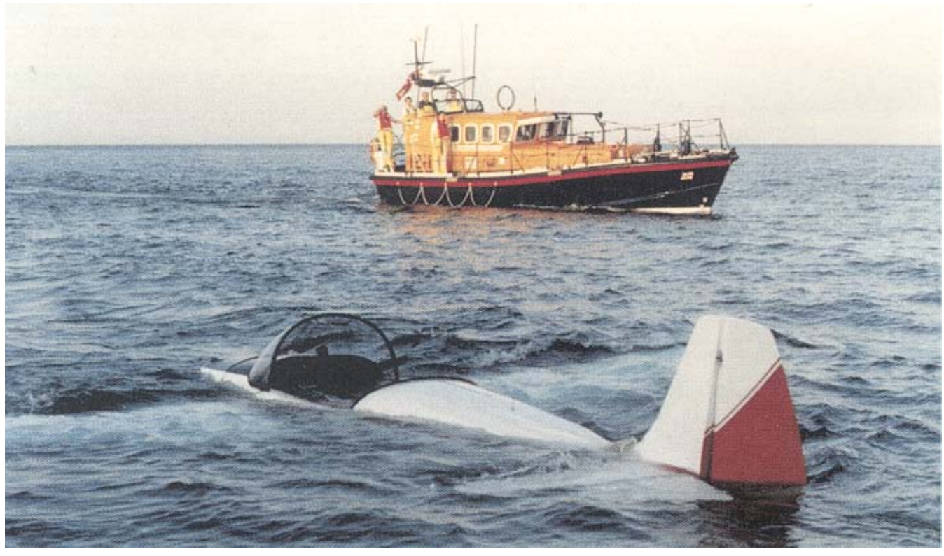
Piel Emeraude - Irish Sea 1991

1 INTRODUCTION 2 KNOWLEDGE 3 PREPARATION 4 PRACTICE a) SUPPLEMENT A b) SUPPLEMENT B 5 MAIN POINTS