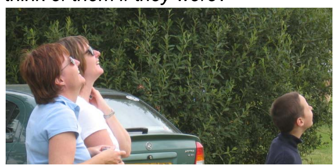
Are you impressing anyone?

clubhouse, or even passengers taken for a flight. The temptation to 'show off', to impress those watching, proved fatal in too many cases. (In 'audience' fact, the are necessarily filled with admiration while watching these antics. They may simply be wondering when the accident will happen, and what this person is doing with a licence.) Before you decide to take such a risk, ask yourself: would the people who are watching be prepared to risk their lives to impress you? What would you think of them if they were?