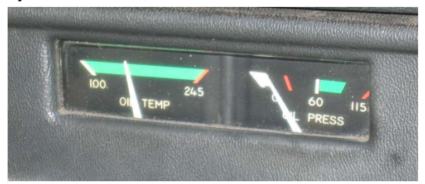
A deteriorating situation

Just as human beings can make errors, mechanical and electronic devices can also be faulty. THINK about what your instruments should say - do a mental 'reality check'. Always cross-check with a second source (e.g. landmarks in the outside view) if possible. Change - especially movement - attracts attention from our senses, but a static condition, or a very slow rate of change, is more likely to go unnoticed. It is important to check all instruments regularly never think that your attention will automatically be drawn deteriorating situation. If your fuel gauge is stuck on full, the needle will remain steady, although actual fuel levels will be dropping. There will be no rapid movement or change to attract your attention.