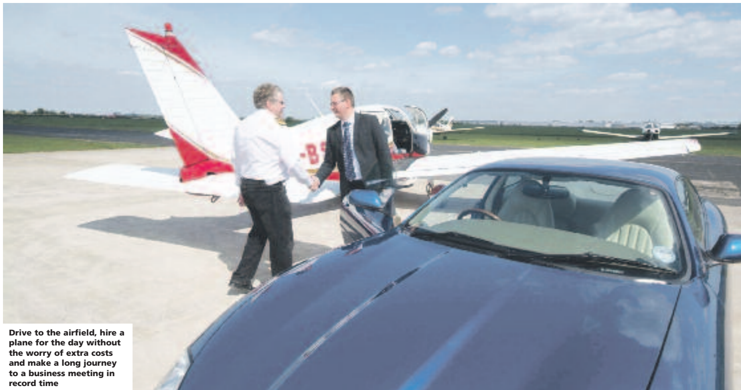
Drive to the airfield, hire a plane for the day without the worry of extra costs and make a long journey to a business meeting in record time

hour (£99 at the weekend) – a figure that includes fuel, VAT and even unlimited landings at Wellesbourne. The newly acquired Cessna 150 Aerobat is even cheaper at just £79 per hour (£89 at weekends) while the six-seat Cherokee Six can be rented for £189 per hour (£199 at weekends). “We strongly feel that flying should