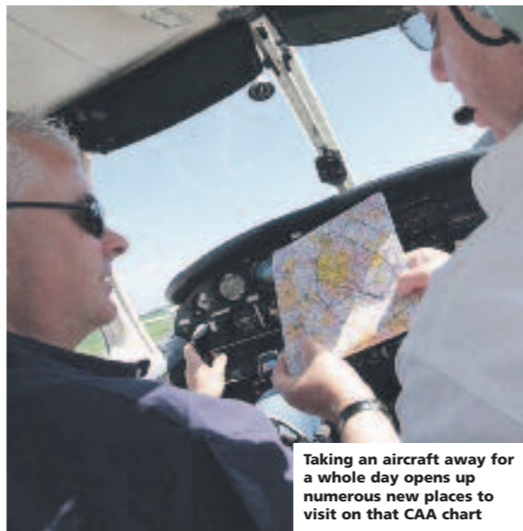
Taking an aircraft away for a whole day opens up numerous new places to visit on that CAA chart