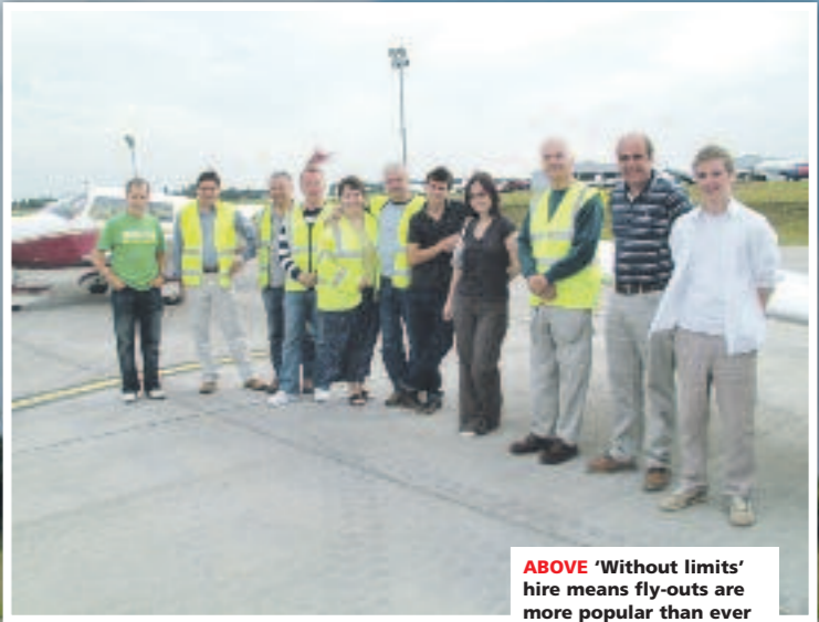
ABOVE 'Without limits' hire means fly-outs are more popular than ever BELOW relax outside on the decking and plan your flight or simply watch airfield life