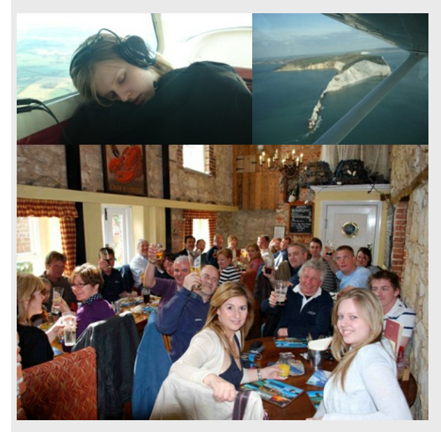
29 members and colleagues in 8 aircraft flew to the Isle of Wight with a lunch at the "Crah and Lobster" The event was run